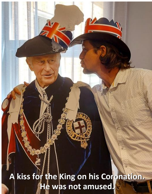
A kiss for the King on his Coronation. He was not amused.