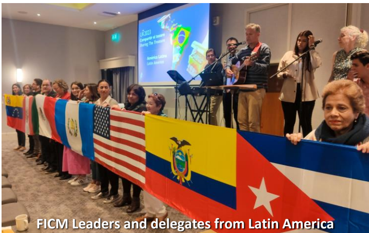
FICM Leaders and delegates from Latin America

Freedom in Christ Ministries (FICM) does this by producing resources for disciple-making movements, currently in over 40 countries.