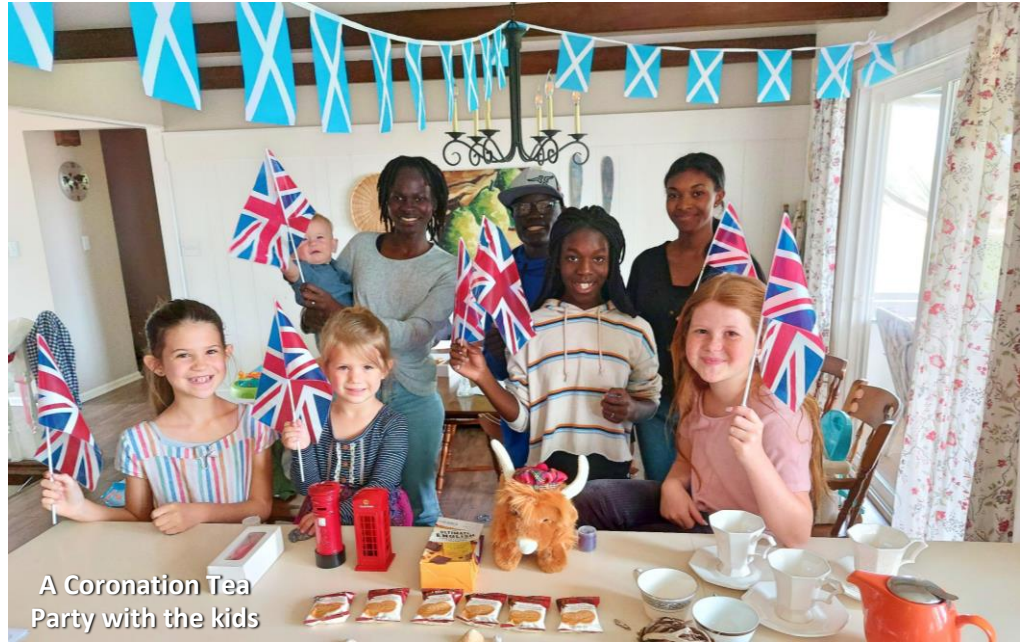
A Coronation Tea Party with the kids

Thank you for your continued partnership in the Gospel with us as we seek to mobilize disciple-making movements around the world with Freedom in Christ Ministries and Global Outreach International .