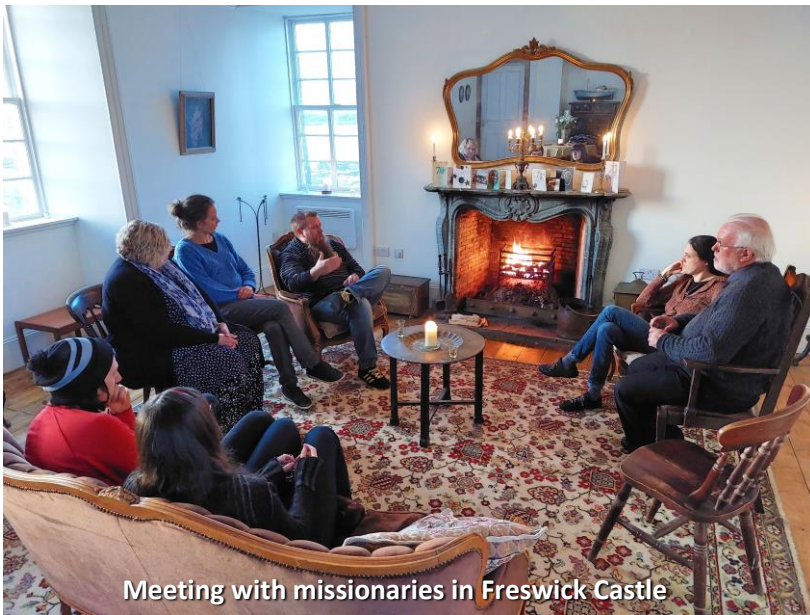
Meeting with missionaries in Freswick Castle