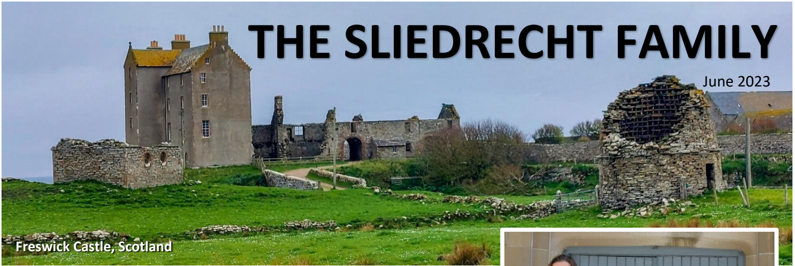
Freswick Castle, Scotland