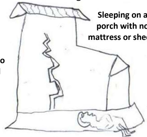
Sleeping on a porch with no mattress or sheets