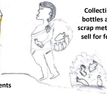
Collecting bottles and scrap metal to sell for food